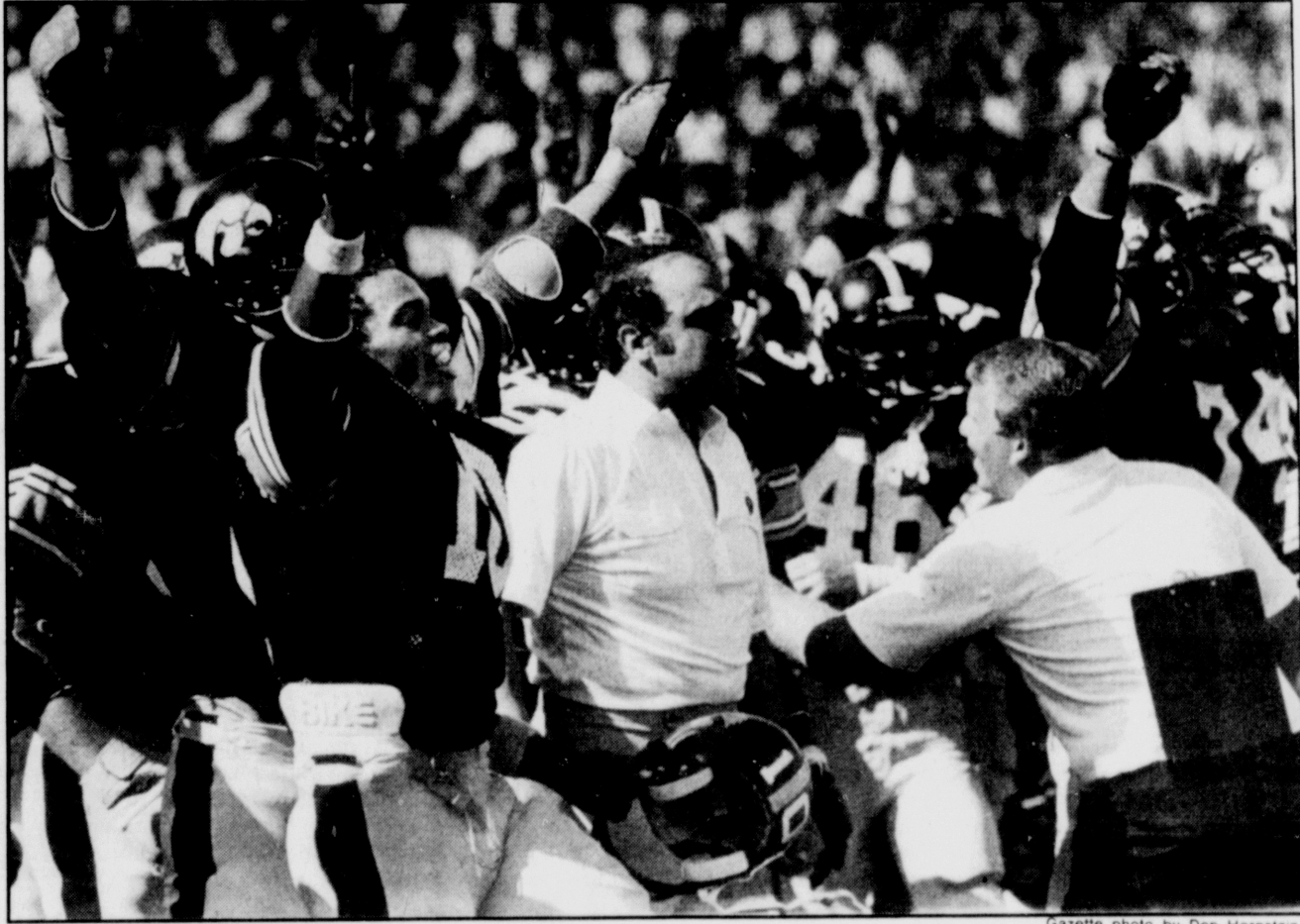
The Iowa bench celebrates following last week's 10-7 upset victory over Nebraska