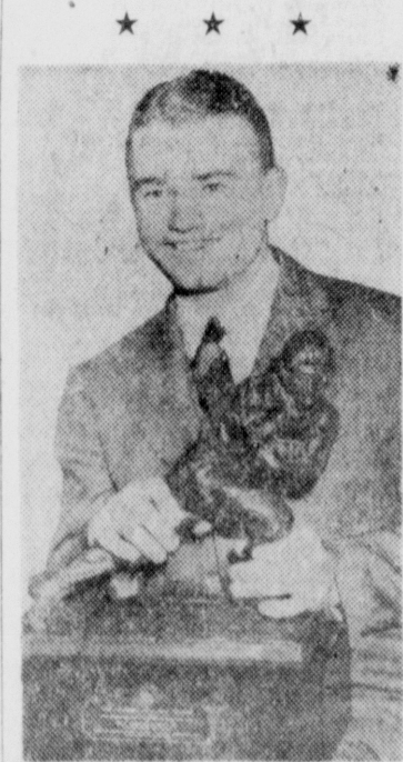
NILE CLARK KINNICK Iowa's only Heisman winner

FXL says Iowa needs a real win far more than another "moral victory." Last year Iowa lost to Ohio State, Penn State and Oregon State by a combined margin of 129-54 and